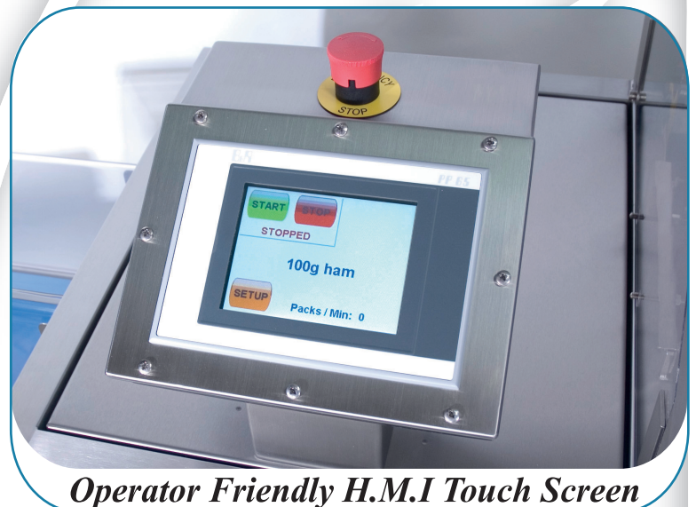
Operator Friendly H.M.I Touch Screen

High reliability stacking Continuous or Batched outfeed Very quick setup Up to IP67 protection High speed – up to 180 packs/minute